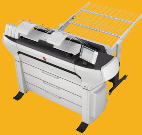
OCÉ COLORWAVE 3700 PRINTER