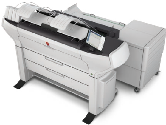
OCÉ COLORWAVE 3500 PRINTER WITH OCÉ FOLDER PROFESSIONAL 3011