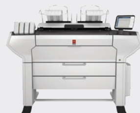
OCÉ COLORWAVE 3500 PRINTER

Rock solid wide format printing with unparalleled ease of use