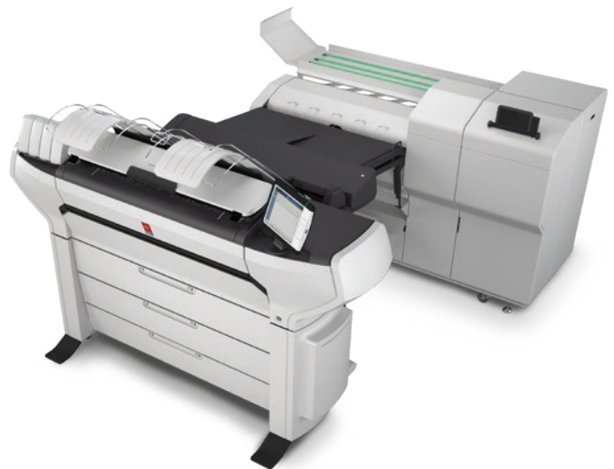
OCÉ COLORWAVE 3700 PRINTER WITH OCÉ FOLDER PROFESSIONAL 6013