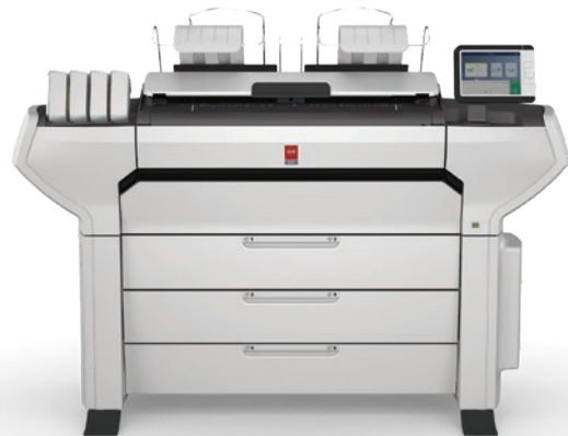
OCÉ COLORWAVE 3700 PRINTER WITH OCÉ MEDIASENSE