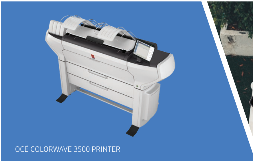
Océ COLORWAVE 3500 PRINTER