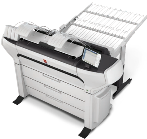
OCÉ COLORWAVE 3700 PRINTER WITH OCÉ STACKER SELECT