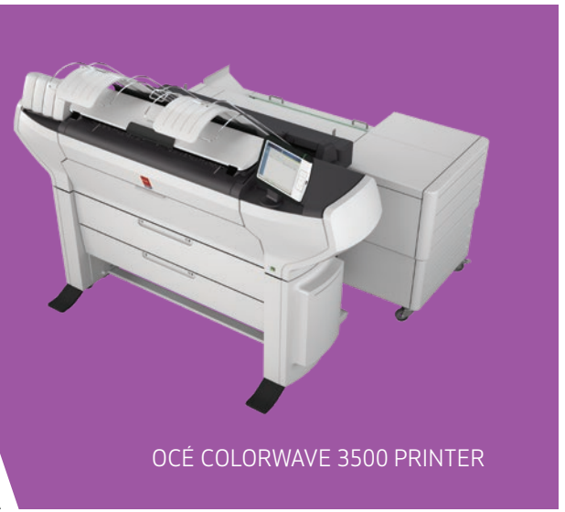
OCÉ COLORWAVE 3500 PRINTER