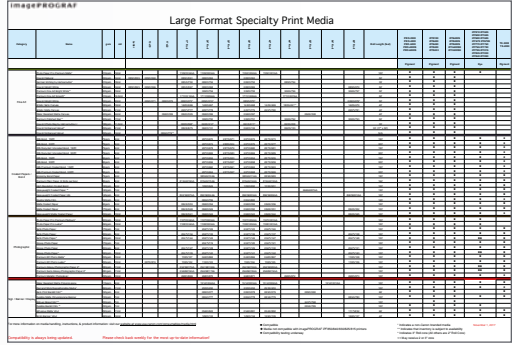
Large-format Printer Media Guide