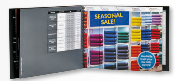
imagePROGRAF Specialty Media Swatch Book

For more information on Canon Media, please visit the Canon Consumables Web site at usa.canon.com/consumables/media.