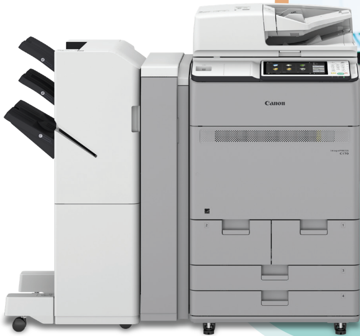
imagePRESS Lite C170 shown with optional accessories.