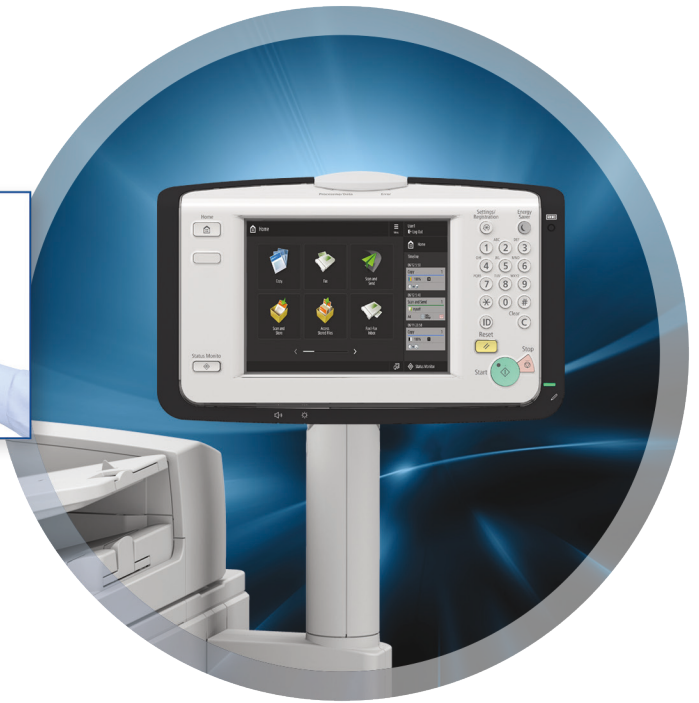
Optional accessories shown above.