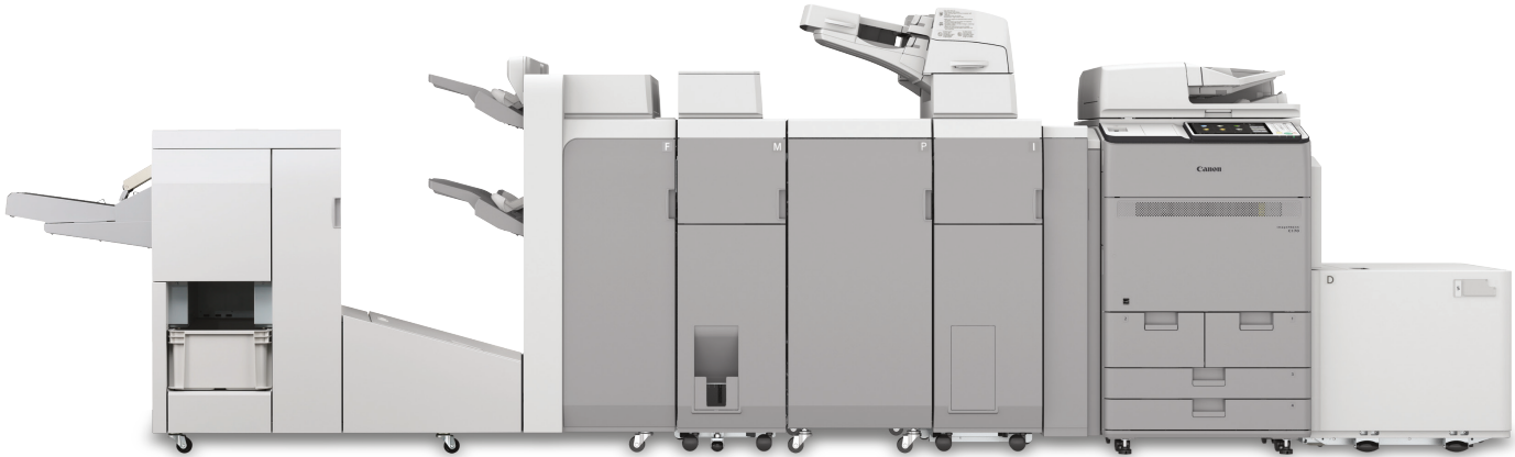
imagePRESS Lite C170 shown with optional accessories.

From professional punching to folding and saddle-stitching, you can have the ability to satisfy more people and keep more in-house.