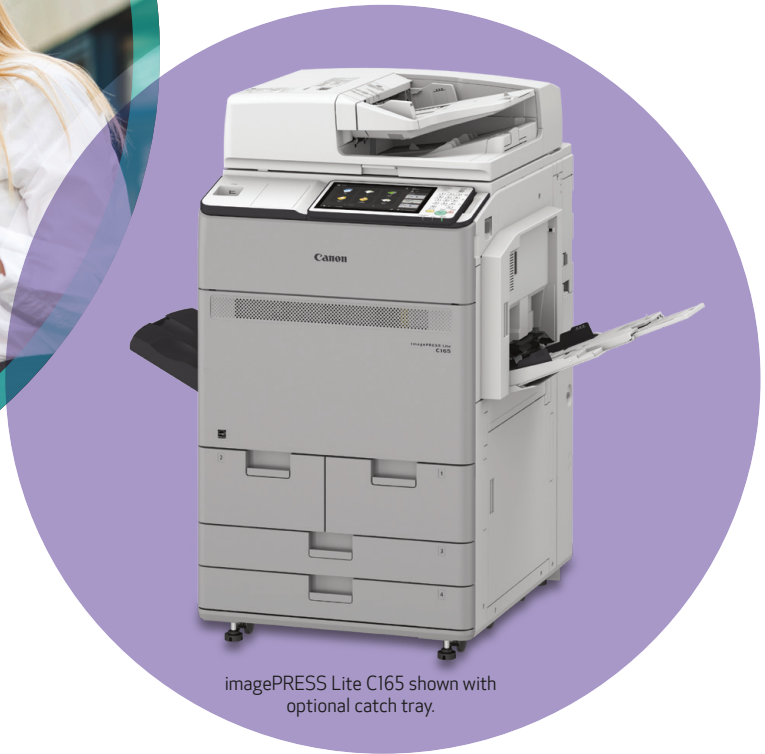
imagePRESS Lite C165 shown with optional catch tray.