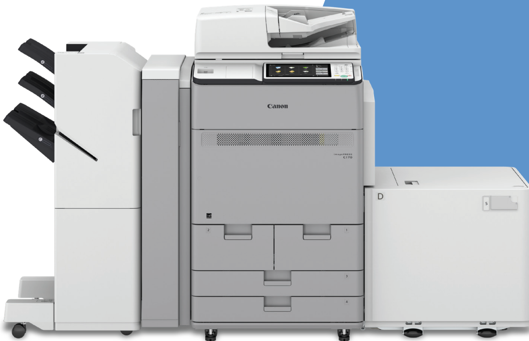
imagePRESS Lite C170 shown with optional accessories.